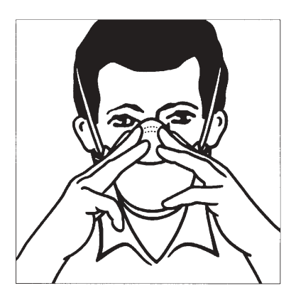
5. Using both hands, mould noseclip to the lower part of the nose.