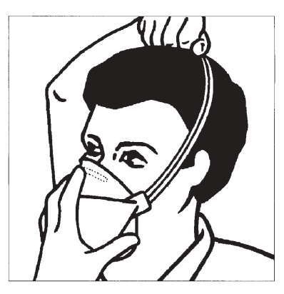
3. Cup respirator under chin. Ensure the two straps are separated and pull the straps over the head, one at a time.