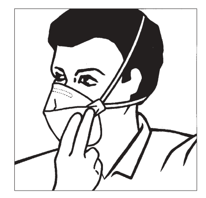
4. Locate the lower strap below the ears and the upper strap across the crown of the head. Adjust top and bottom panels for a comfortable fit.